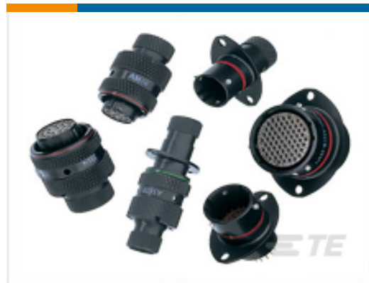
TE Part #AS616-35PA PLUG BOOT TERMIN'N TYPE 6