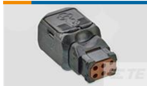
TE Part #D369-P66-CP0 369 6 WAY PLUG, NO CONTACTS, PIN