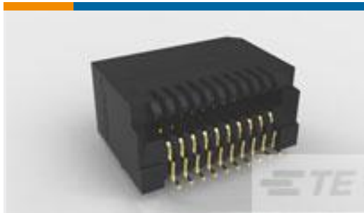
TE Part #1367073-1 20 POS SMT CONN, SFP, 15AU