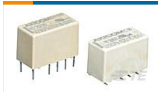
TE Part #1-1393788-6 V23079A1005B301