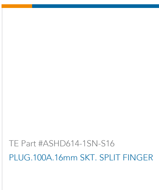
TE Part #ASHD614-1SN-S16 PLUG.100A.16mm SKT. SPLIT FINGER