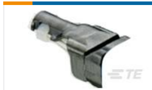
TE Part #D369-STB-6 369 6 WAY BACKSHELL STRAIGHT TIE WRAP