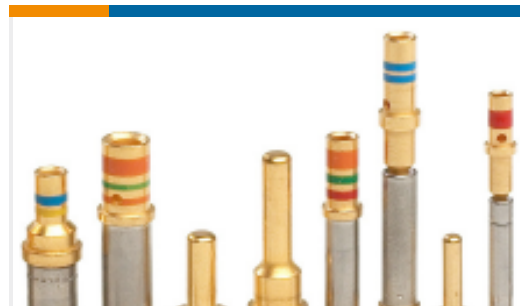
TE Part #ZPF00000000000003597 724-0003-16