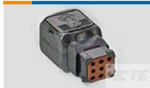
TE Part #D369-R99-NS0 369 9 WAY REC, NO CONTACTS, SKT