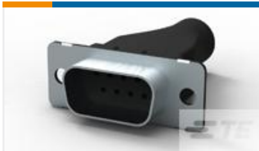
TE Part #1658645-1 KIT,HDP-20,OVRMLD,PLUG,SIZE 1,