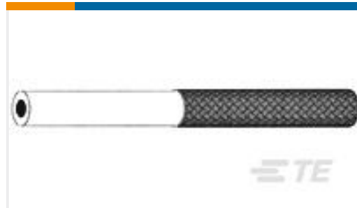
TE Part #D561523001 RAY-101-4.0(100)