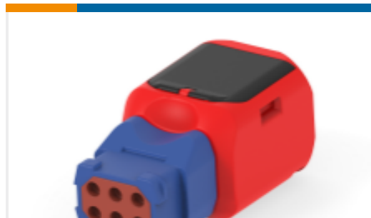
TE Part #YD369-P66-BS000000 Rectangular Connectors: 6-Way Plug