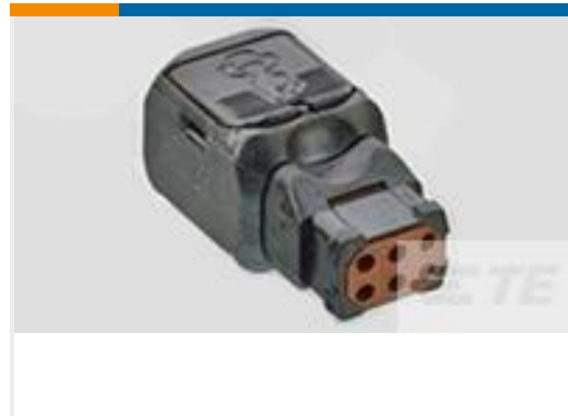
TE Part #D369-R66-BS0 369 6 WAY REC, NO CONTACTS, SKT