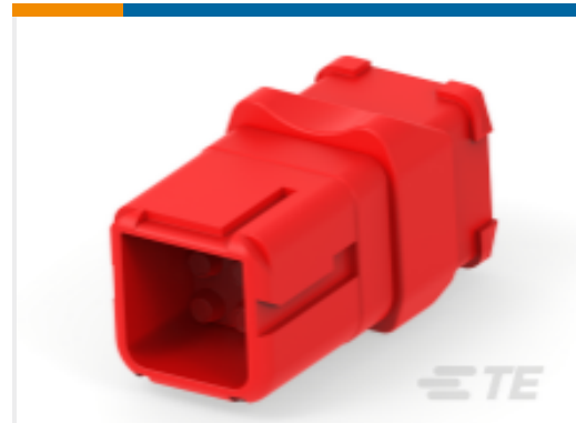
TE Part #D369-R99-AS0 Rectangular Connectors, 9 Way Receptacle