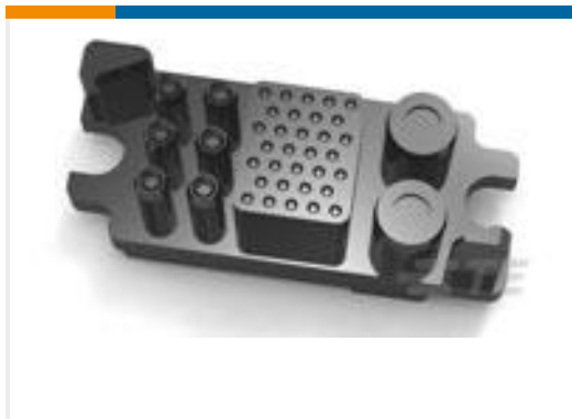
TE Part #1648157-1 242-28-01100