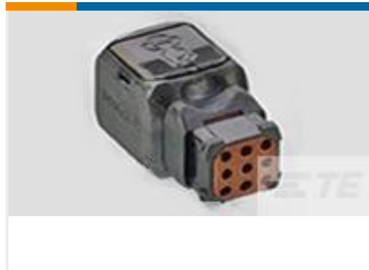
TE Part #D369-P99-NP0 369 9 WAY PLUG, NO CONTACTS, PIN