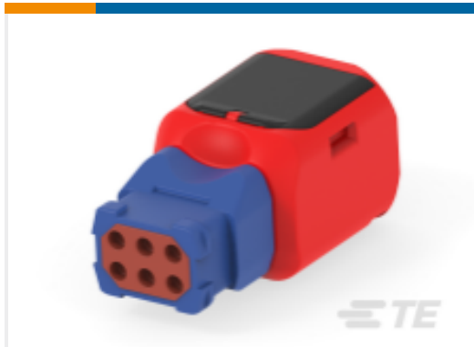
TE Part #D369-P66-NP0 Rectangular Connectors: 6-Way Plug