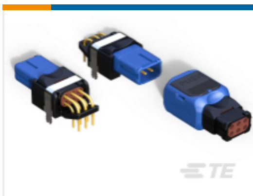
TE Part #YD369-B99-AS4-119P 369 9 WAY PANEL MNT REC, 90 PCB SKT 119P