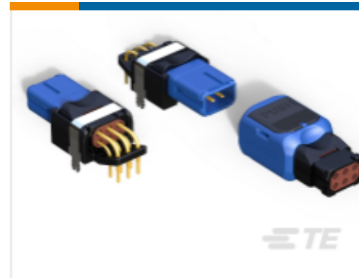
TE Part #YD369-B99-AP4-119P 369 9 WAY PANEL MNT REC, 90 PCB PIN 119P