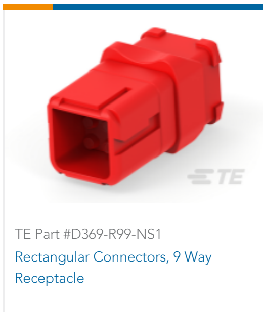
TE Part #D369-R99-NS1 Rectangular Connectors, 9 Way Receptacle