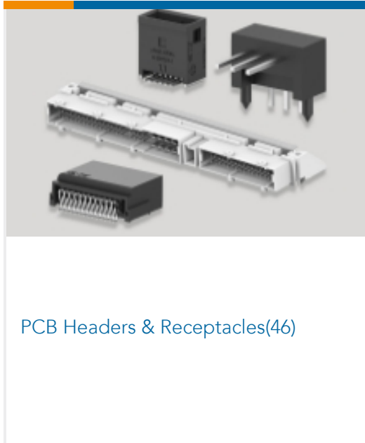
PCB Headers & Receptacles(46)