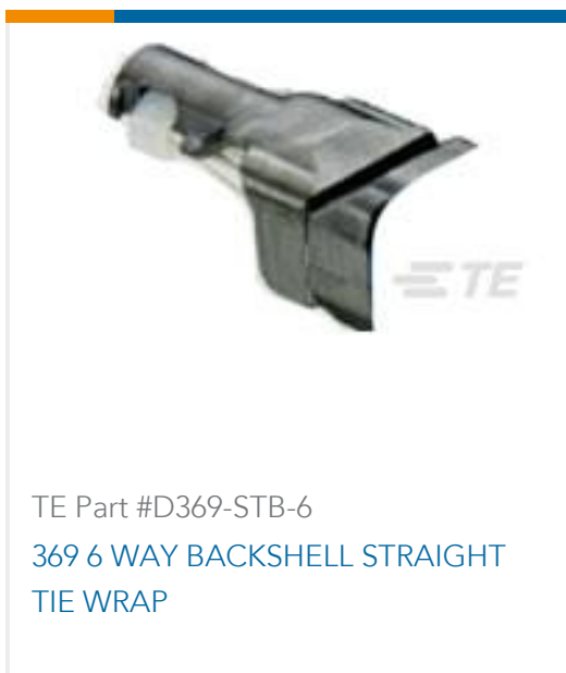
TE Part #D369-STB-6 369 6 WAY BACKSHELL STRAIGHT TIE WRAP