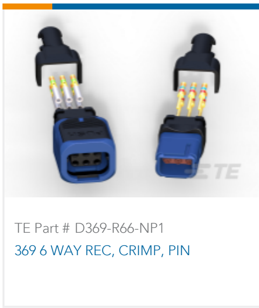
TE Part # D369-R66-NP1 369 6 WAY REC, CRIMP, PIN