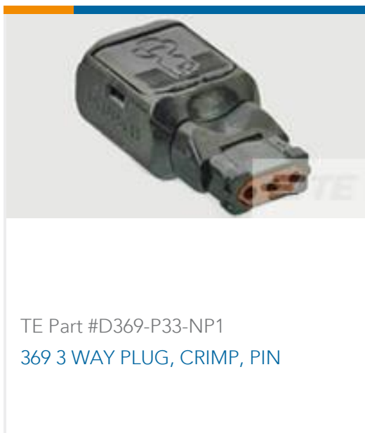
TE Part #D369-P33-NP1 369 3 WAY PLUG, CRIMP, PIN