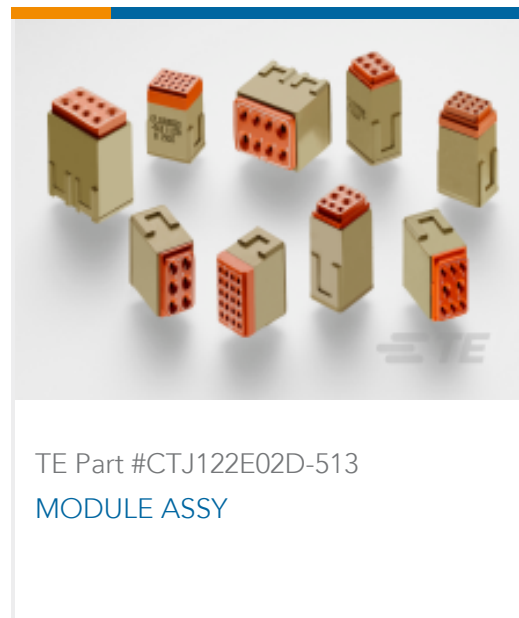
TE Part #CTJ122E02D-513 MODULE ASSY