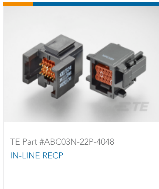
TE Part #ABC03N-22P-4048 IN-LINE RECP