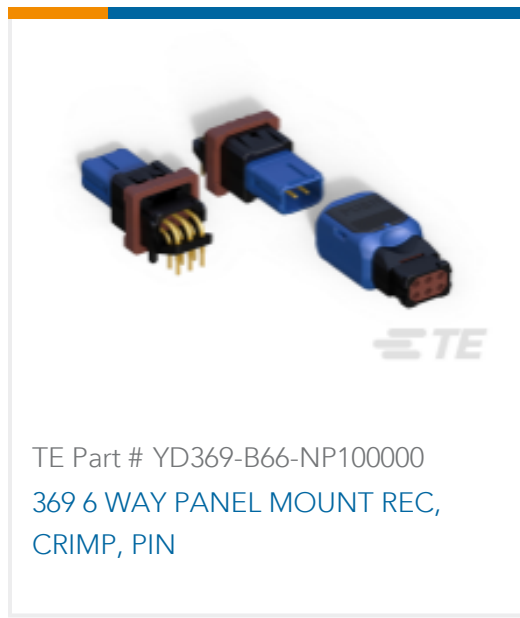
TE Part # YD369-B66-NP100000 369 6 WAY PANEL MOUNT REC, CRIMP, PIN