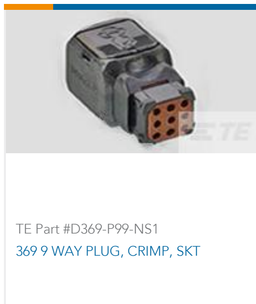
TE Part #D369-P99-NS1 369 9 WAY PLUG, CRIMP, SKT