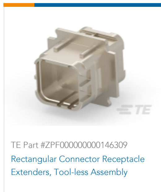
TE Part #ZPF000000000146309 Rectangular Connector Receptacle Extenders, Tool-less Assembly