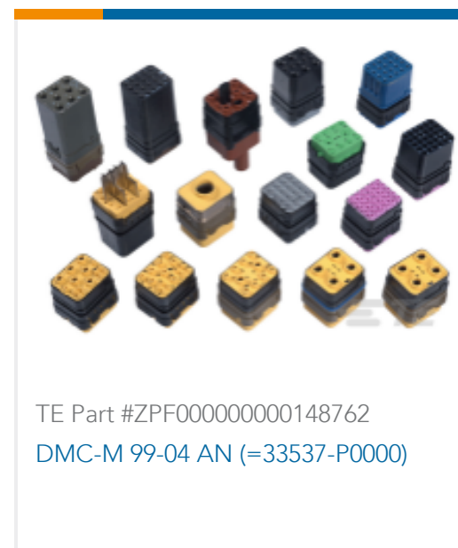
TE Part #ZPF000000000148762 DMC-M 99-04 AN (=33537-P0000)