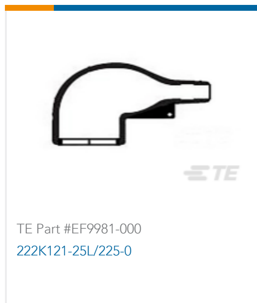
TE Part #EF9981-000 222K121-25L/225-0