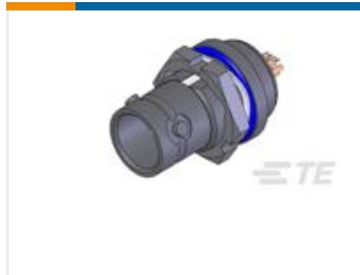
TE Part #2174223-1 Bayonet 7P Rece PS S-Cup Cont KIT/N