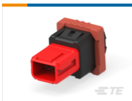
TE Part # CAT-D369-B66 Rectangular Connectors: 6-Way Panel Mount, 90PCB