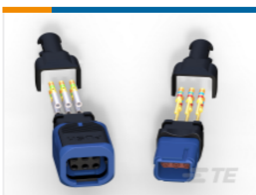
TE Part # D369-R66-AS0 369 6 WAY REC, NO CONTACTS, SKT