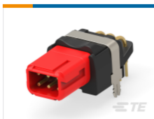
TE Part # CAT-D369-G66 PCB Mount Receptacle: 6-Way Inline