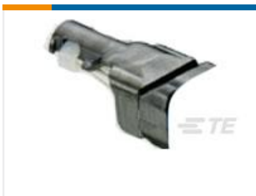
TE Part #D369-STB-3 369 3 WAY BACKSHELL STRAIGHT TIE WRAP