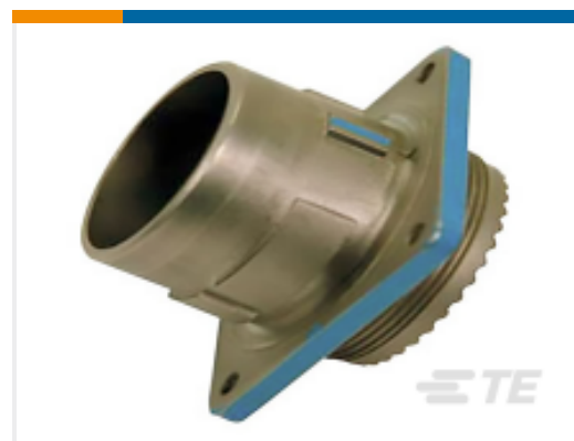
TE Part #YDIV43E17-35SAV001 RECP ASSY