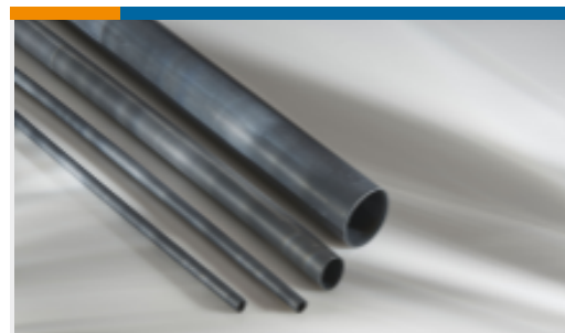
TE Part #EH2298-000 DWFR-16/4-0-STK