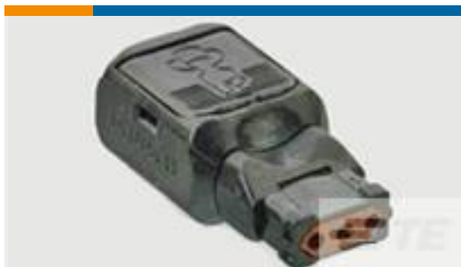
TE Part #D369-R33-NP1 369 3 WAY REC, CRIMP, PIN