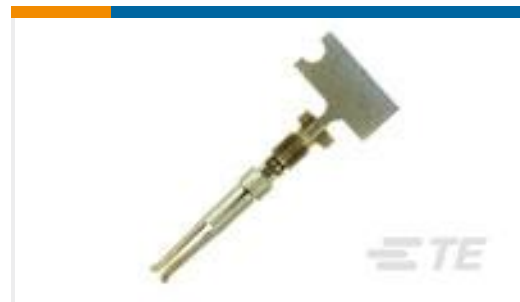
TE Part #1658537-3 SOCKET CONT DUPL PLT STRIP HD-