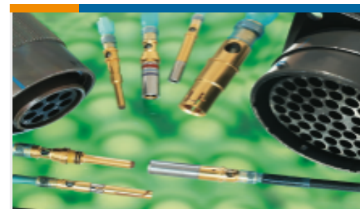
TE Part #488105-000 D-602-0127