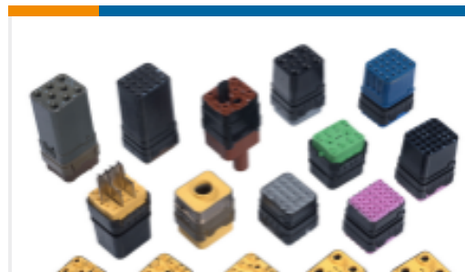
TE Part #ZPF000000000015306 DMC-M 20-22 PN