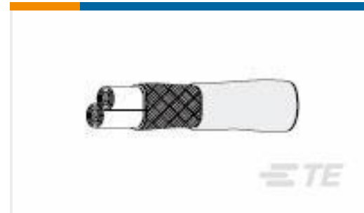
TE Part #3822543004 44A1121-22-0/9-9