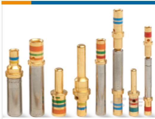
TE Part #1662-213-2031 CONT SOC ASSY