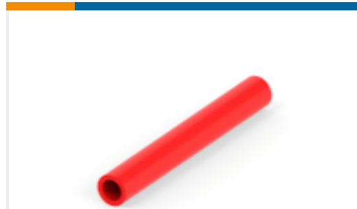
TE Part #NB08642001 ATUM-24/6-2-STK