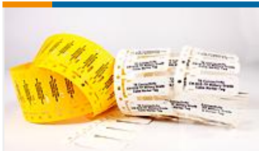
TE Part #E17344-000 CM-SCE-TP-1/2-4H-9