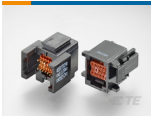
TE Part # ABC06N-22P IN-LINE PLUG