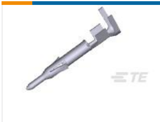
TE Part # 170364-3 MINI UNIVERSAL M-N-L PIN LP