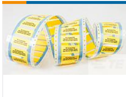
TE Part # 3573650001 TMS-SCE-3/16-2.0-S1-9