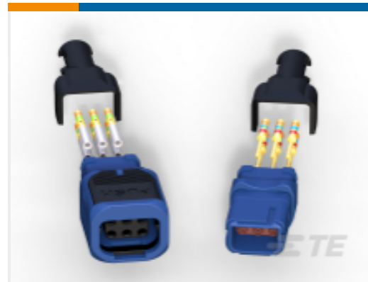
TE Part # YD369-HP33-NS00000 369 HARSH 3 WAY PLUG, SKT - BACC65CP1SN