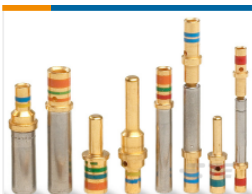
TE Part # ZPF000000000004365 81539-23