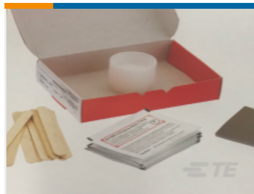
TE Part # 890036-000 S1009-KIT-A