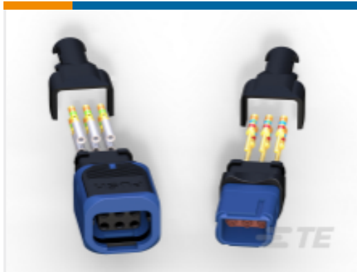
TE Part # D369-P33-NP0 369 3 WAY PLUG, NO CONTACTS, PIN