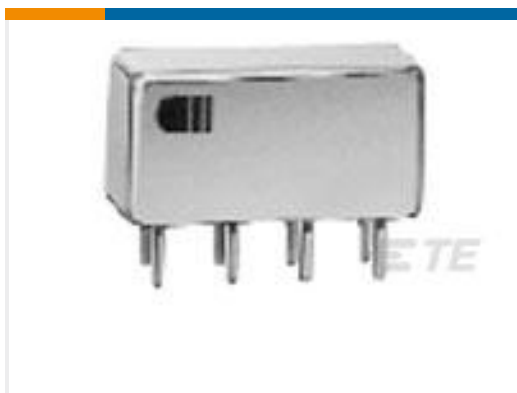
TE Part #1617037-7 HFW5A1201G00 = HFW 5AMP RELAY