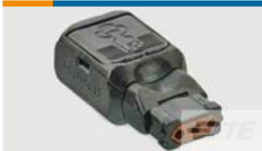
TE Part #D369-P33-NS1 369 3 WAY PLUG, CRIMP, SKT