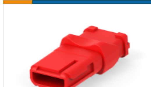
TE Part #D369-R33-NP0 Rectangular Connectors, 3 Way Receptacle