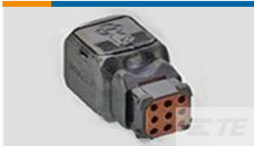
TE Part #D369-P99-AP0 369 9 WAY PLUG, NO CONTACTS, PIN