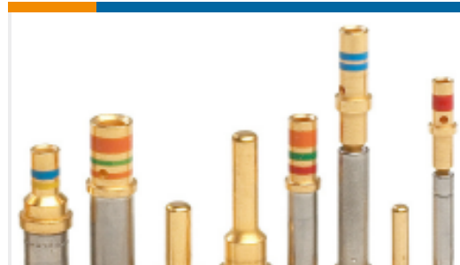
TE Part #ZPF000000000121738 182-0860-22