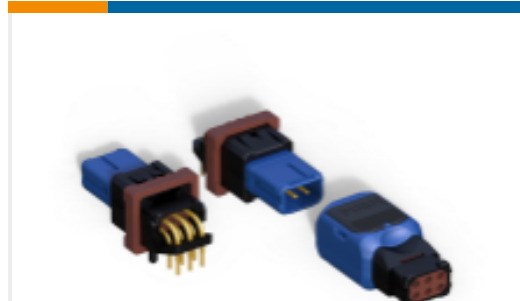
TE Part #YD369-B99-NP000000 369 9 WAY PANEL MNT REC, NO CONTACTS,PIN