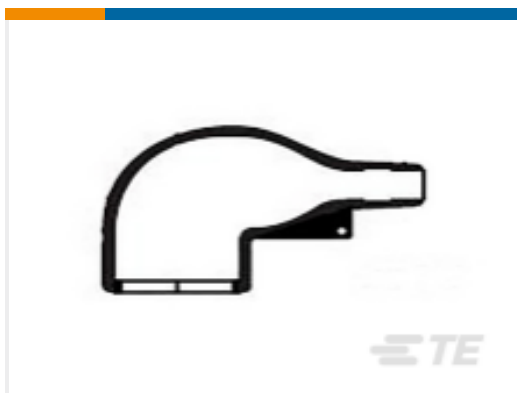
TE Part #EF9981-000 222K121-25L/225-0