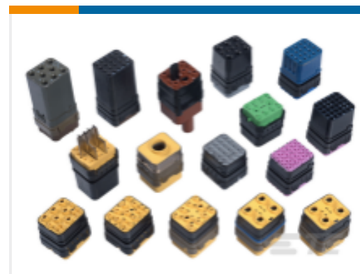
TE Part #ZPF000000000148762 DMC-M 99-04 AN (=33537-P0000)