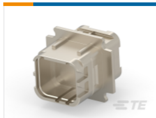
TE Part #ZPF000000000146309 Rectangular Connector Receptacle Extenders, Tool-less Assembly