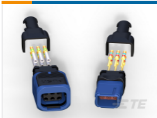
TE Part # YD369-P33-BS000000 369 3 WAY PLUG, NO CONTACTS, SKT