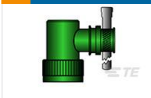
TE Part #CW3823-000 R85049/90-13W03