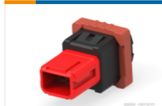
TE Part #YD369-B66-NP000000 Rectangular Connectors: 6-Way Panel Mount, 90PCB