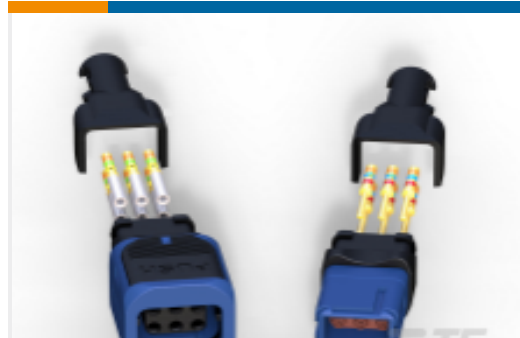
TE Part #YD369-P33-AS000000 369 3 WAY PLUG, NO CONTACTS, SKT