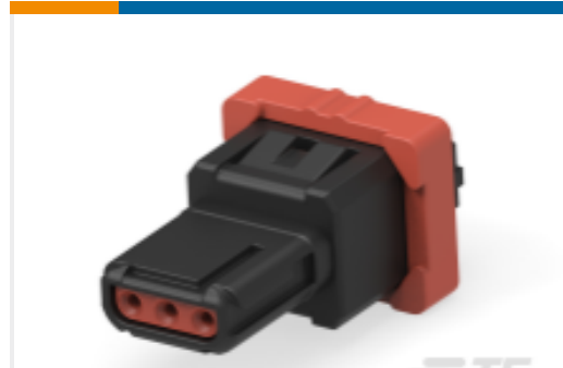
TE Part #YD369-B33-AP000000 Rectangular Connectors: 3-Way Panel Mount, 90PCB