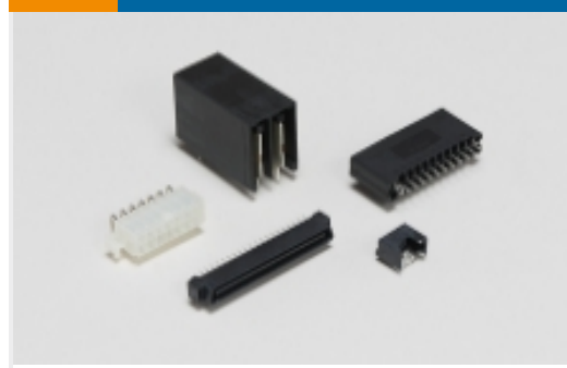
Standard Rectangular Connectors(403)