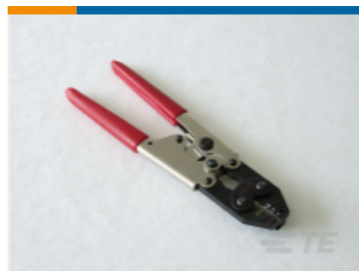
TE Part # 992008-000 AD-1377-CRIMP-TOOL-3-CVTY