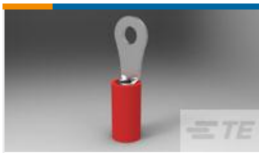
TE Part #330648 PIDG R 22-16 COMM 22-18 MIL 4