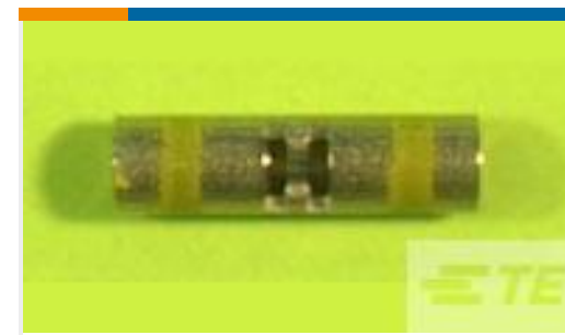
TE Part #680328-000 D-609-08