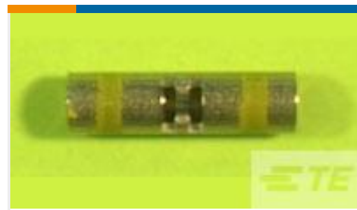
TE Part #680326-000 D-609-06