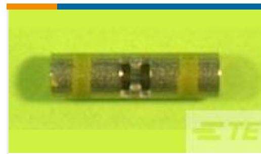
TE Part #680327-000 D-609-07