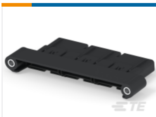
TE Part #2380582-2 3POS,HC-STAK 35,HDR ASSY,COD A