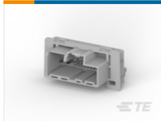
TE Part #1-2288244-2 24P HYBRID HEADER ASSY, KEY B