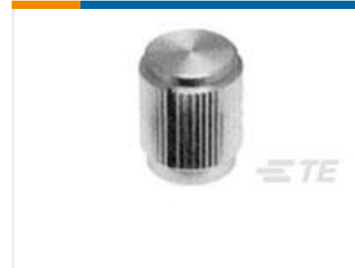
TE Part #4-1437622-7 KN500B1/8=KNOB BLK KNURL 1/8 S