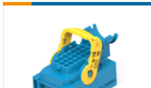
TE Part #3-2333508-1 AMP MCP 2.8 SOCKET HSG 21 POS SEALED