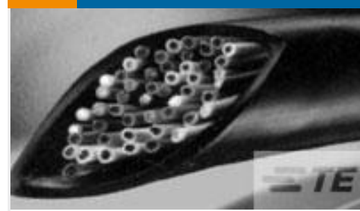
TE Part #F41960-000 NT-MIL-1-1/4-0-SP