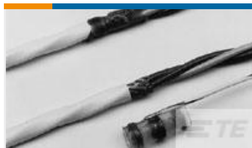
TE Part #CW1046-000 S03-09-R-100-HN