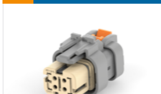
TE Part #2320934-1 AS16, PLUG ASSY, HT, 04P, E SEAL, CODE A