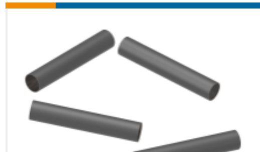
TE Part #NB25842001 SCL-3/8-0-STK