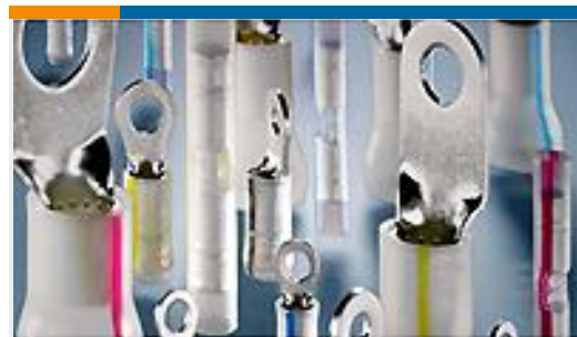
TE Part #53546-1 SPLICE BUTT PVF2 PIDG 26-22