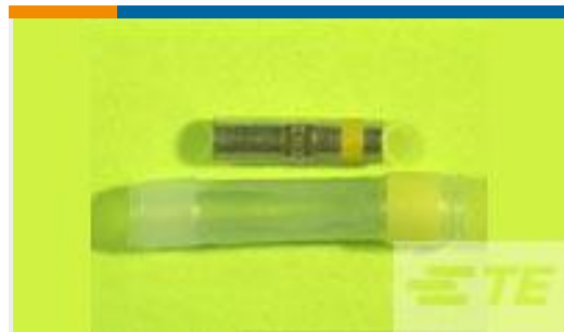
TE Part #650133-000 D-436-89