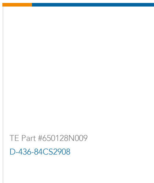
TE Part #650128N009 D-436-84CS2908