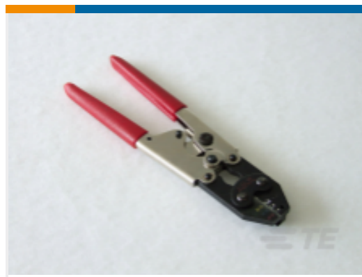
TE Part # 992008-000 AD-1377-CRIMP-TOOL-3-CVTY