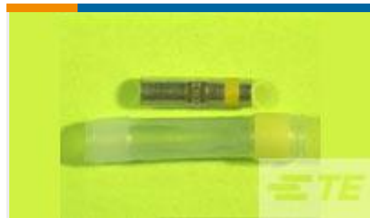
TE Part #650129-000 D-436-85