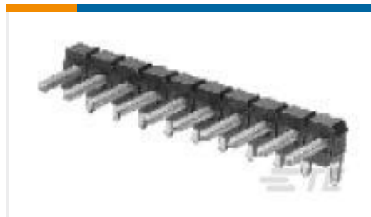
TE Part #825437-3 MOD 2 PINHDR 1X03P.