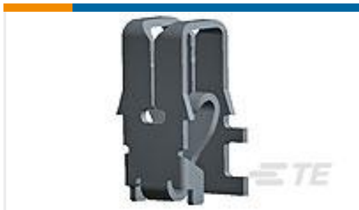
TE Part #926851-4 MAG-MATE LEAF KONT