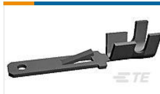
TE Part #60294-1 FF 250 TAB 22-18AWG BR