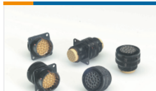
TE Part #ZPF00000000018735 FDBA 50H 14-19 PW-K