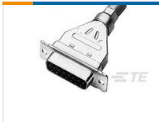
TE Part #1658649-1 KIT,HDP-20,OVRMLD,RCPT,SIZE 3,