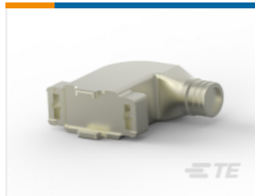
TE Part #134752-3 KIT CAPOT HD-20 9P