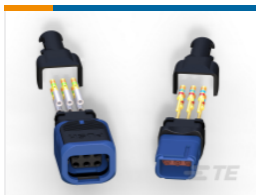
TE Part #YD369-P66-BS000000 369 6 WAY PLUG, NO CONTACTS, SKT