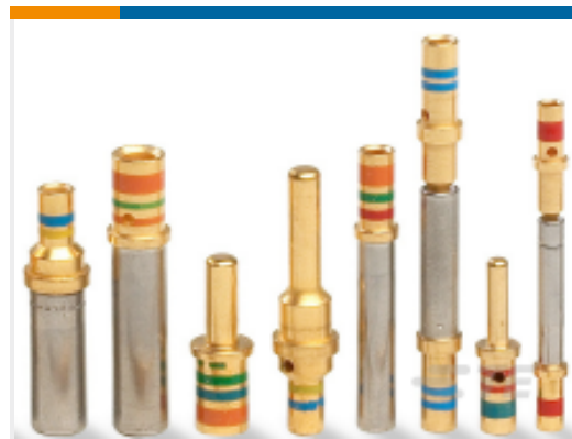
TE Part #109028-31 CONT PIN