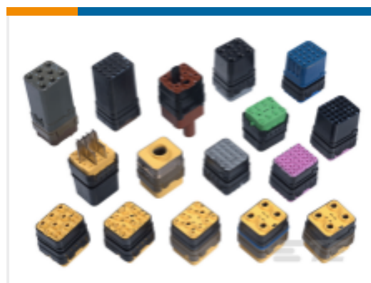
TE Part #ZPF000000000099705 DMC-M 99-01 BN