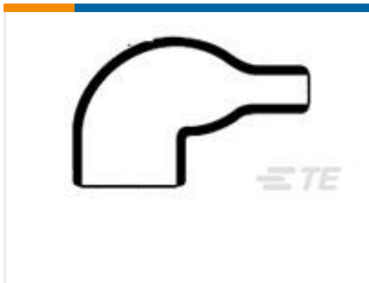
TE Part #806798-000 222A111-25-0