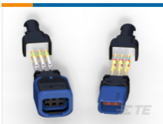
TE Part #YD369-P33-BS000000 369 3 WAY PLUG, NO CONTACTS, SKT