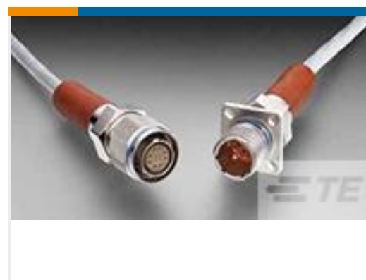
TE Part #YCFX26M1108PZN000 PLUG ASSY