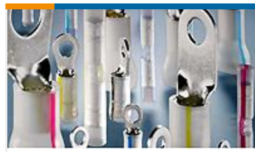
TE Part #53416-1 TERMINAL,PIDG PVF2 R 16-14 6