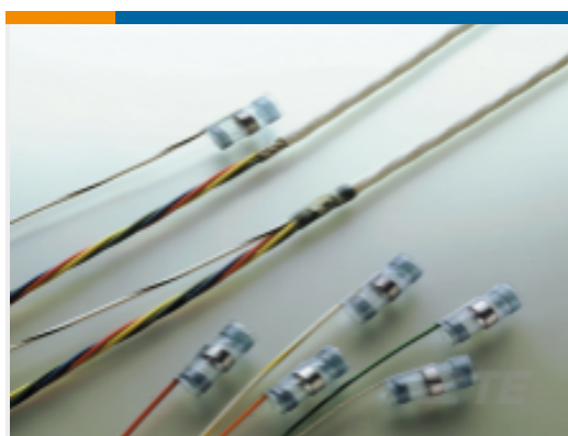
TE Part #691894N001 S02-17-R-9CS928