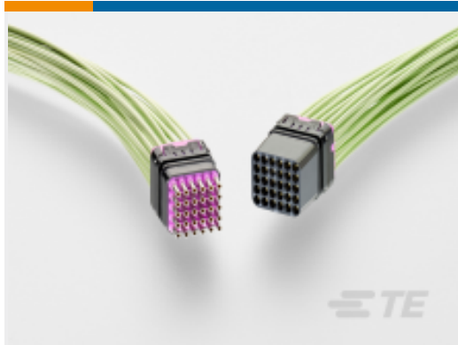
TE Part #ZPF000000000203400 DMC-MR 30-23 SA