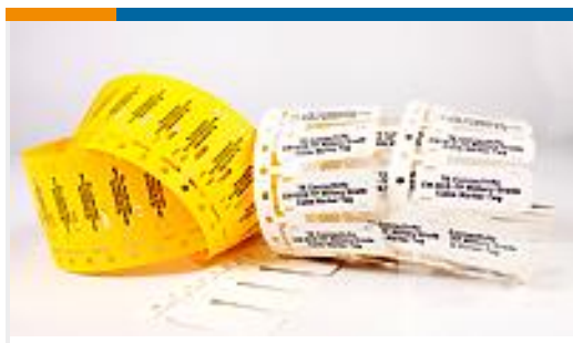
TE Part #E61464-000 HTCM-SCE-TP-1/2-6H-9