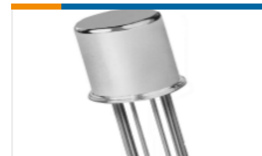
TE Part #8-1617352-4 JMACT-18XM=M28776/1-029M