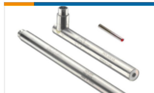
TE Part #02560413-012 LVDT HCA 050 TB 5K ASSY