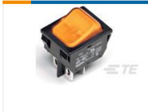
TE Part #1634201-5 PRFDB1-16F-BG000