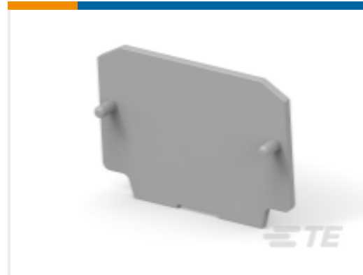
TE Part #1SNA117318R2300 FEDR5