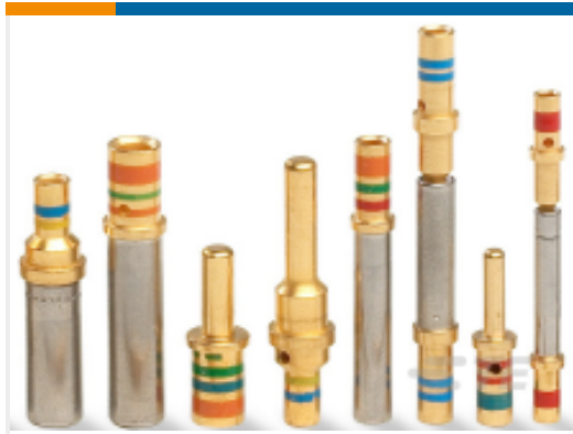
TE Part #ZPF0000000000000362 006-0937-16 A