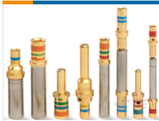
TE Part #ZPF0000000000000569 020-0511-16