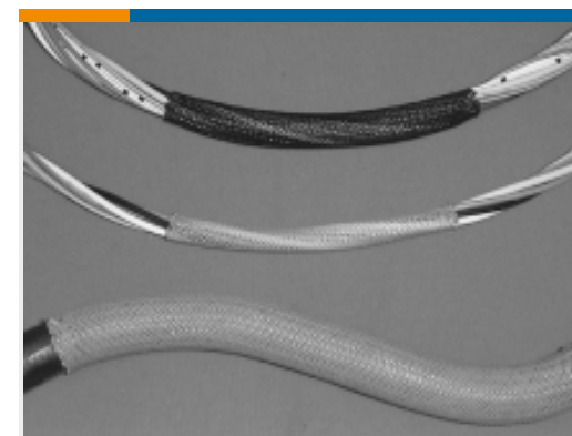
TE Part #CH02024001 VERSAFLEX Heat Shrink Tubing