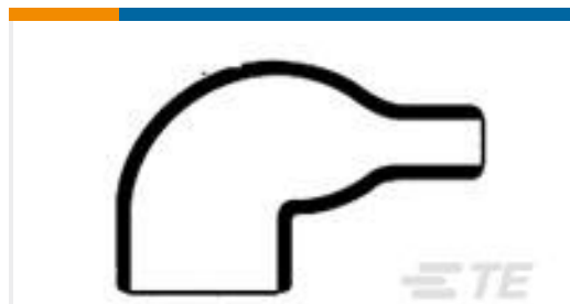
TE Part #814554-000 222A121-25-0