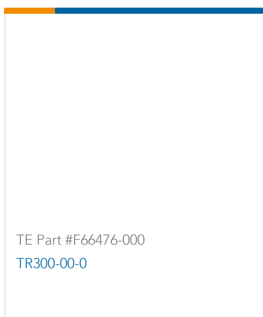
TE Part #F66476-000 TR300-00-0