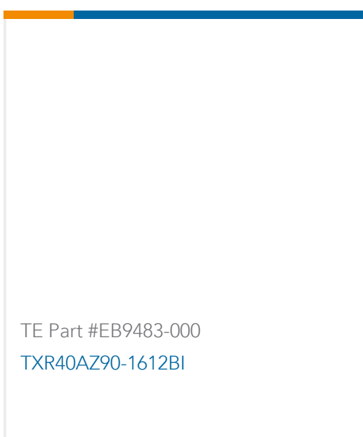
TE Part #EB9483-000 TXR40AZ90-1612BI