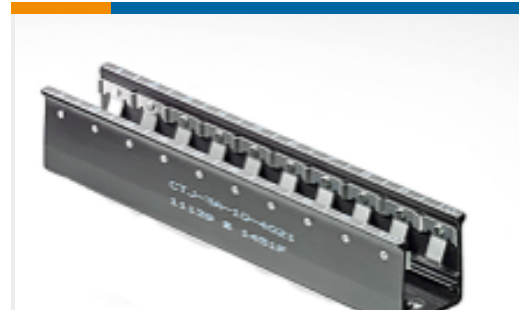
TE Part #CTJ-3D-05 RAIL ASSY