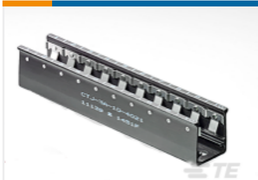
TE Part #CTJ-3D-06 RAIL ASSY