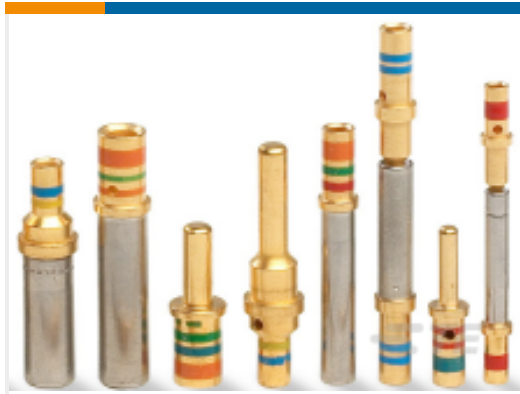
TE Part #0641-1-2031L CONT PIN