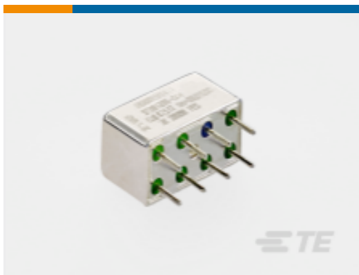
TE Part #ES2050401CTL ES2050401CTL=RELAY