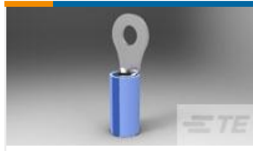
TE Part #51864-6 TERMINAL,PIDG R IR 16 6