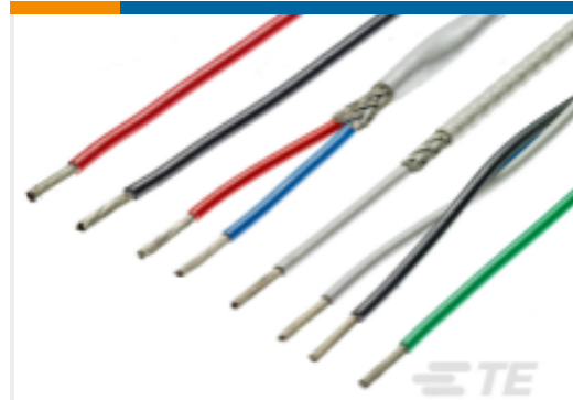
TE Part #C55123-000 WXA-0059-12-9CS2972