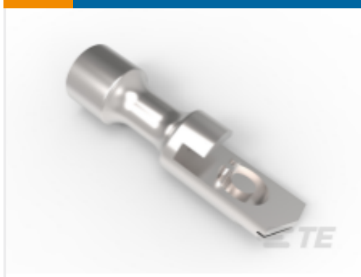
TE Part #53435-1 AMPOWER Knife Disconnect