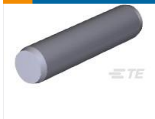
TE Part #201501-1 SPIROL PIN