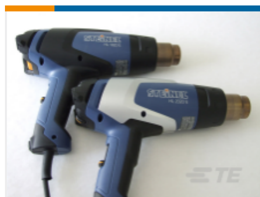
TE Part # EG8162-000 HL1920E-230V-EURO