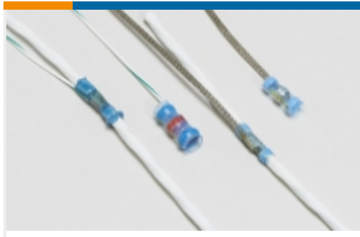
SolderSleeve Shield Terminators(24)