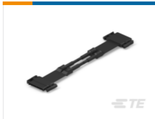
TE Part #766667-1 Wave Crimp, Flat to Round 8 AWG Cbl Assy