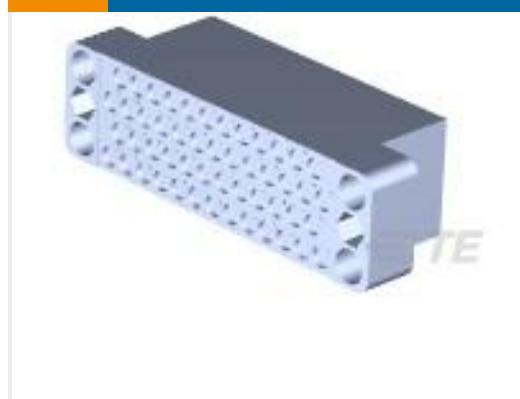
TE Part #200277-4 BLOCK,50 POSN,M SERIES