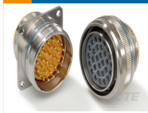
TE Part #ZPF000000000007538 983-0SE 12-12 PN