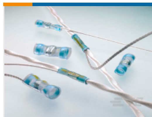
TE Part #EJ3512-000 S200-1-55-22-9CS2904