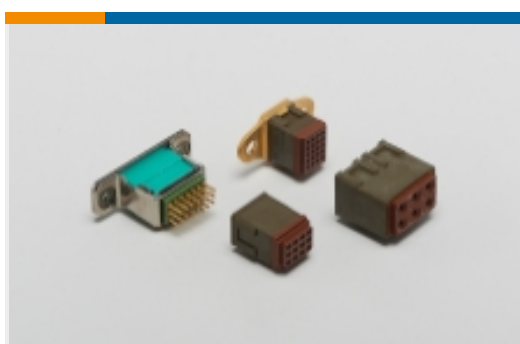
Terminal Junction Modules(120)