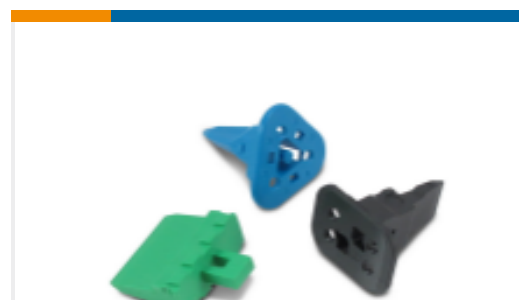
TE Part #W2S WedgeLocks: DEUTSCH DT