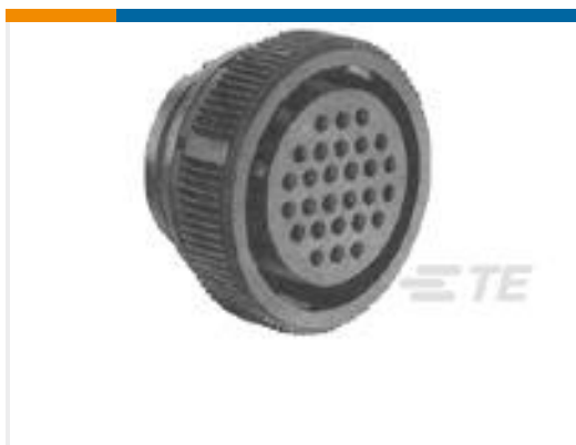
TE Part #206126-1 CPC PLUG ASSEMBLY SIZE 17-28