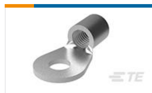
TE Part #321298 TERMINAL,SOLIS R 6 10