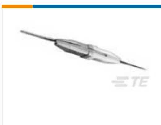
TE Part #91066-4 INSERTION/EXTRACTION TOOL