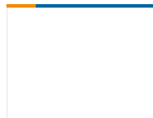
TE Part #CTS-S20-20 CONT SOC ASSY