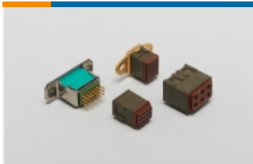
Terminal Junction Modules(120)