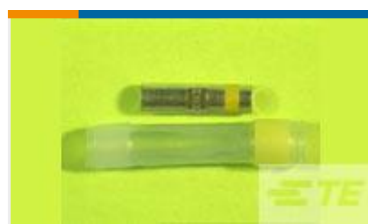
TE Part #650127-000 D-436-83