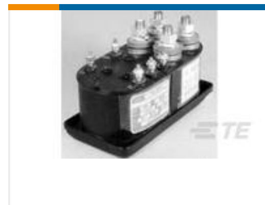
TE Part #1616084-1 AH965H=RELAY