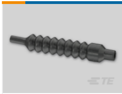
TE Part #F67100-000 202C653-770-0