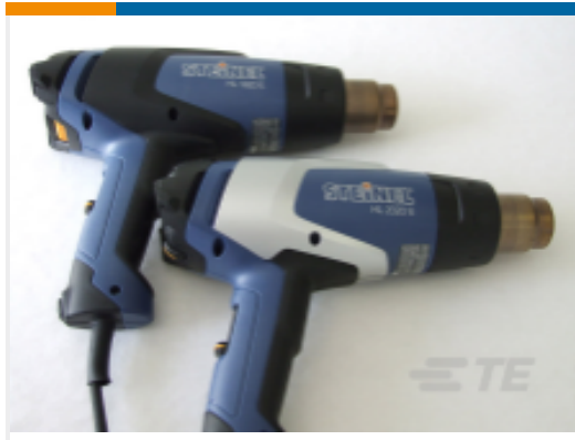
TE Part # EG8162-000 HL1920E-230V-EURO