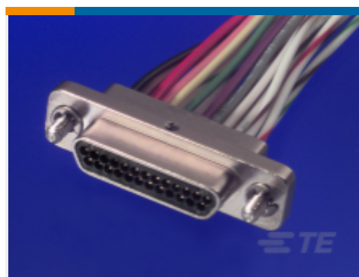
TE Part #3-1532171-0 M83513/04-A14C, MCKS-C2-B-9S6G9-72.0