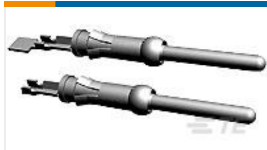
TE Part #1-66400-0 III+ PIN,24-20,TIN,LP