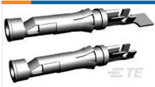
TE Part #66601-9 III+ SKT,18-14,TIN,LP