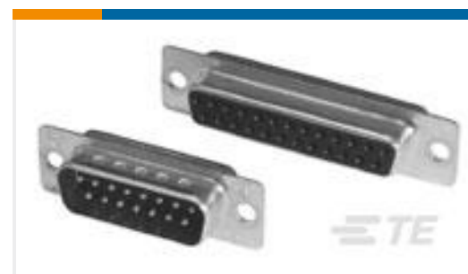
TE Part #5-747908-2 15 Plug Solder Cup, Gold Flash