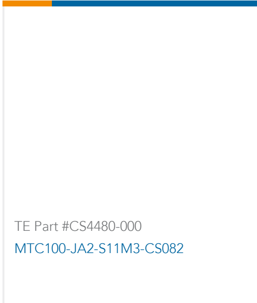
TE Part #CS4480-000 MTC100-JA2-S11M3-CS082