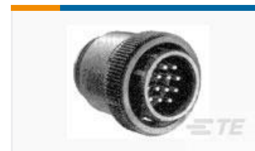
TE Part #206429-1 CPC PLUG ASSY, 11-4, REV SEX