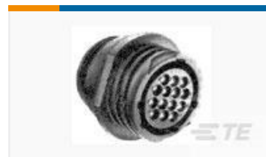
TE Part #206430-2 CPC 11-4 Free Hanging Receptacle