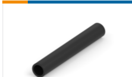
TE Part #NB15252001 CRN Heat Shrink Tubing