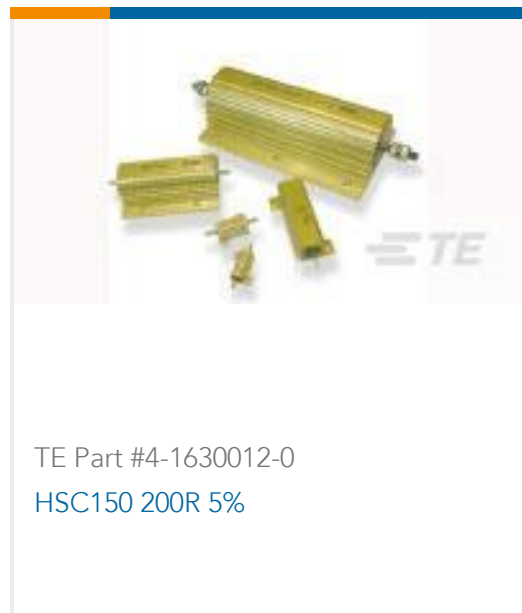
TE Part #4-1630012-0 HSC150 200R 5%