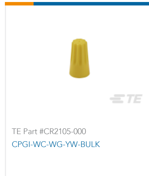
TE Part #CR2105-000 CPGI-WC-WG-YW-BULK