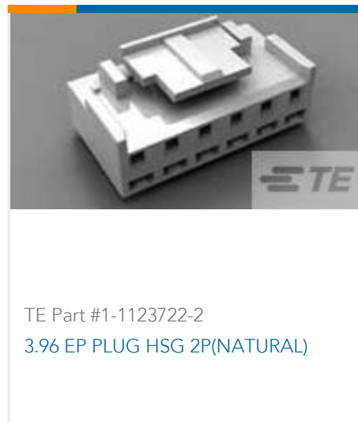
TE Part #1-1123722-2 3.96 EP PLUG HSG 2P(NATURAL)