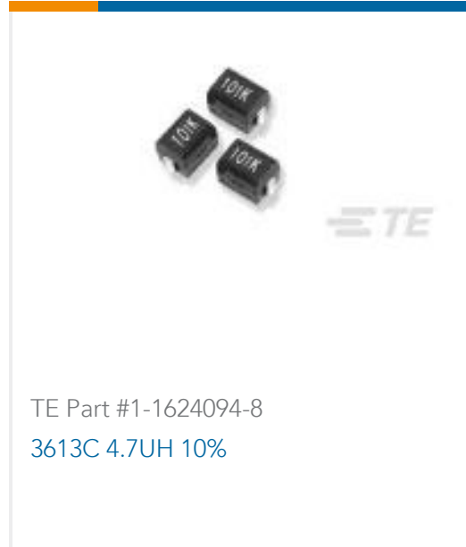
TE Part #1-1624094-8 3613C 4.7UH 10%