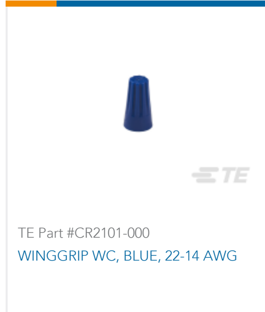
TE Part #CR2101-000 WINGGRIP WC, BLUE, 22-14 AWG