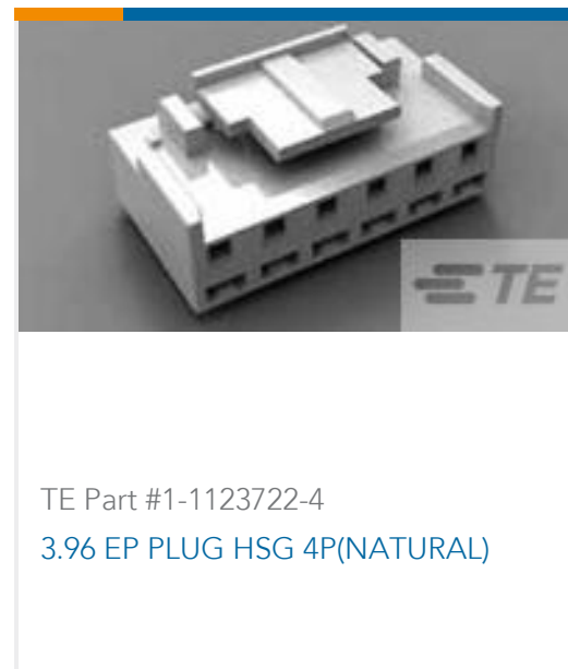
TE Part #1-1123722-4 3.96 EP PLUG HSG 4P(NATURAL)