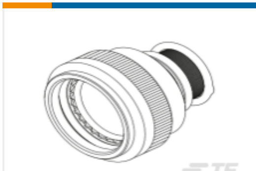
TE Part #E75793-000 TXR40AU00-1210BI