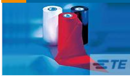
TE Part #754073-000 TMS-RJS-RIBBON-4HT