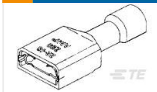
TE Part #3-350820-2 ULTRAFAST 250 ASSY REC 16-14 TPBR LP