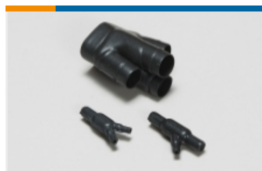
Cable Transitions & Breakouts(3)