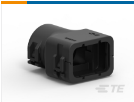
TE Part #2292864-2 AS16,CAP BACKSHELL KIT,ST,08P, NC20