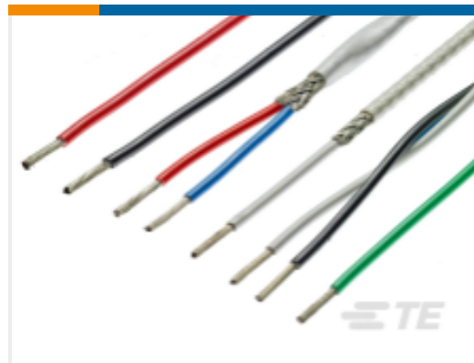
TE Part #4870753002 FLHTC0311-14-0