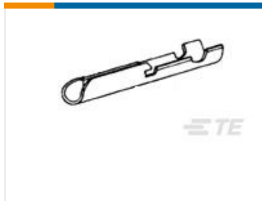
TE Part #62402-1 PIN .106 REC 22-18 AWG (OR) 22AWG PTPBR