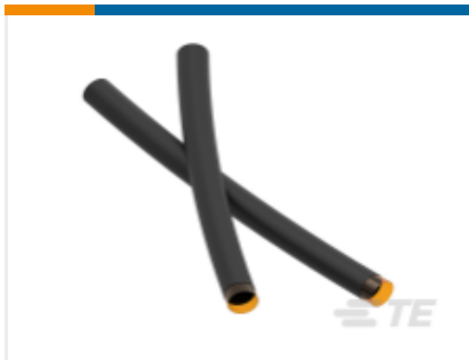
TE Part #EM0967-000 TAT-125-1/2-0-2IN