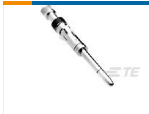
TE Part #200336-6 PIN CONT ASSY, SZ 16, TYPE II