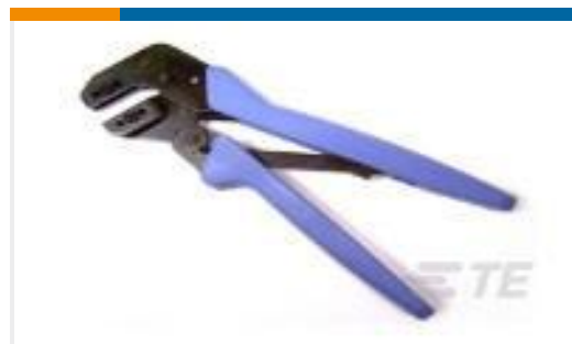
TE Part #58614-1 PROCRIMP, HT&D SL156