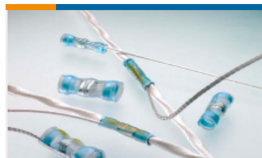
TE Part #CB0220-000 S200-3-W2-18-9