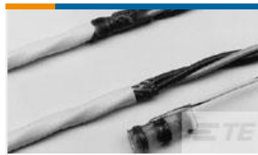
TE Part #CJ4552-000 D-141-30-LF