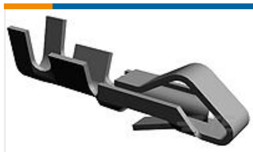
TE Part #640706-2 CONTACT .045 POST PT BRASS