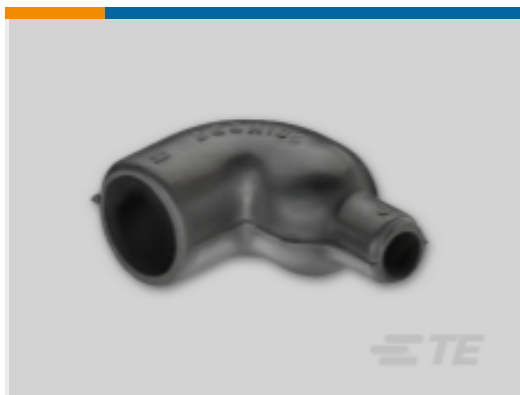
TE Part #806823-000 Bulbous Heat Shrink Boots: Lipped, Right Angle