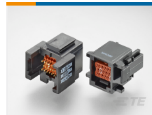
TE Part #ABC06N-22P IN-LINE PLUG