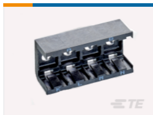
TE Part #DCR-1A-06 COMPOSIT RAIL