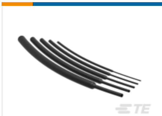
TE Part #5052942064 RNF-100-0 Heat Shrink Tubing