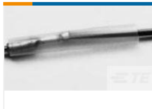
TE Part #CV25362001 RW-175-E-1/16-X-STK