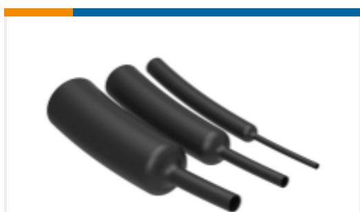
TE Part #1494116001 RNF-3000-NR554-0-40MM