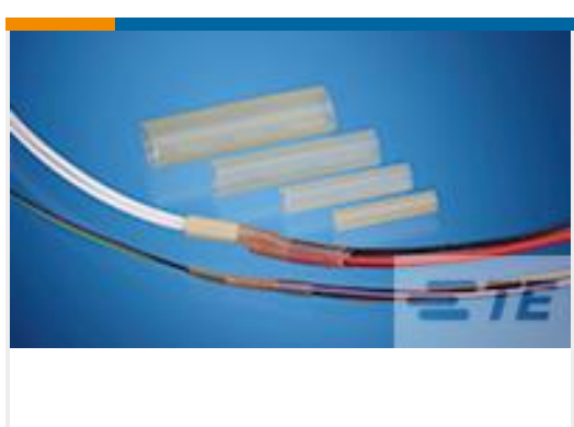
TE Part #0838016006 RBK-VWS-125-NR1-X-40MM