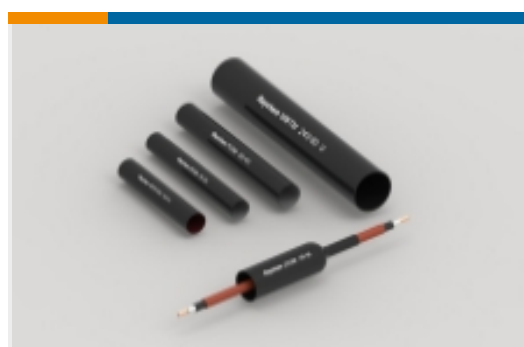
Power Cable Tubing & Accessories(93)