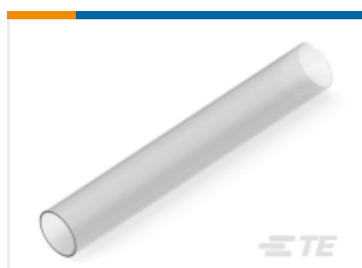
TE Part #5672706013 TSAS-NR503-X-25MM