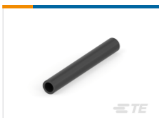
TE Part #2525596010 RBK-ILS Heat Shrink Tubing