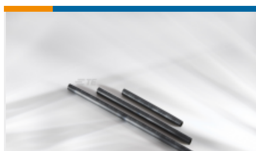
TE Part #543633P086 SCT-NO.1-E6-0-30MM