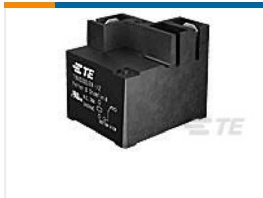
TE Part #1-1393210-4 T9AS1D12-15