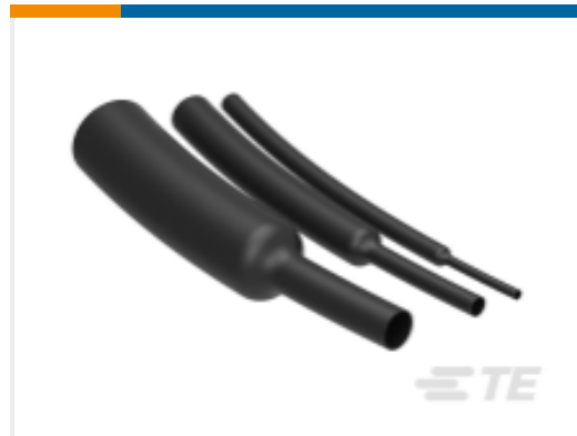
TE Part #5069844021 CGPT 2:1 Heat Shrink Tubing