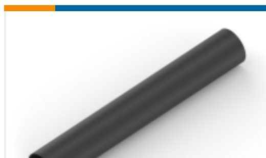
TE Part #NB11652001 ATUM-6/2-0-STK