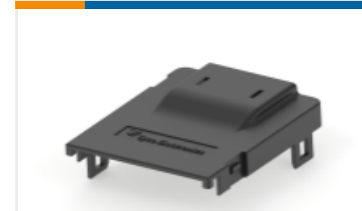
TE Part #1986186-1 Strain Relief,20 Posn,D3000 Dynamic, 2