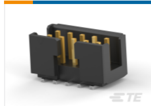
TE Part #1-2373376-0 10P,2MM,SHRD HDR,DRVT,SMD,0.1 AU,TB