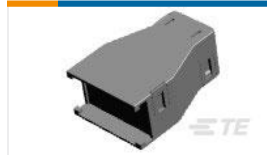
TE Part #1986185-1 Strain Relief,6 Posn,D5200 Dynamic. 2