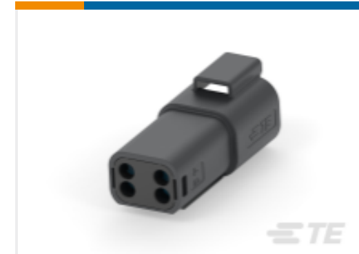
TE Part #1-2600030-0 4CCT BLACK RECEPT W/LARGE SEAL