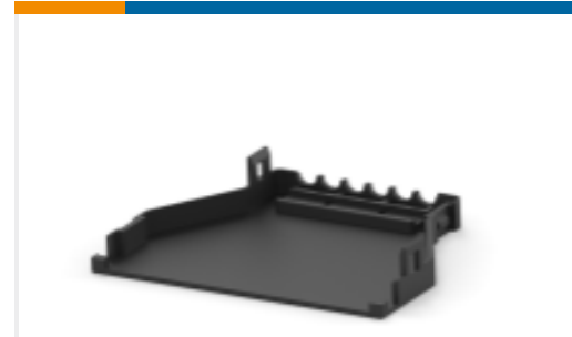
TE Part #1776695-1 Strain Relief, D5200, Dynamic