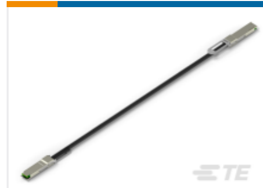
TE Part #2333393-7 QSFP 25GIG 30AWG 3 METER