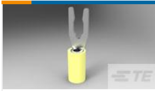
TE Part #52430-3 TERMINAL,PIDG SPR SPD 12-10 6