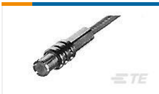
TE Part #1060875-2 MCX CABLE PLUG, CRIMP ATTACH