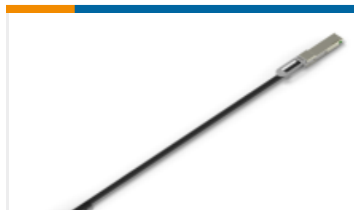
TE Part #2333393-7 QSFP 25GIG 30AWG 3 METER