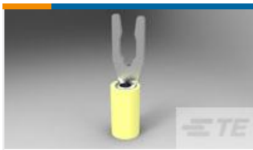
TE Part #52430-3 TERMINAL,PIDG SPR SPD 12-10 6