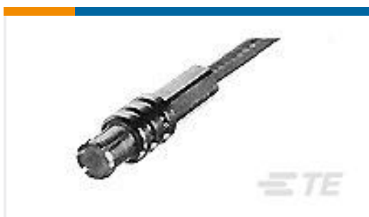
TE Part #1060875-2 MCX CABLE PLUG, CRIMP ATTACH