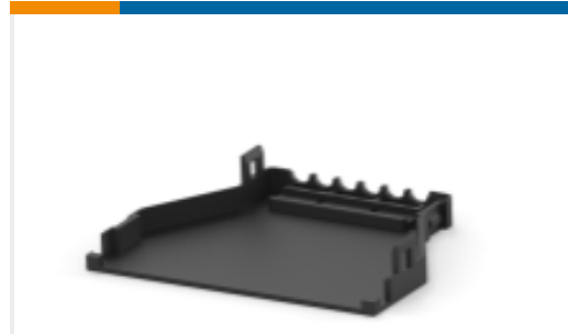
TE Part #1776695-1 Strain Relief, D5200, Dynamic