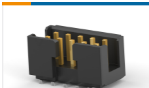
TE Part #1-2373376-0 10P,2MM,SHRD HDR,DRVT,SMD,0.1 AU,TB