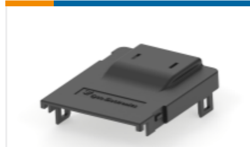
TE Part #1986186-1 Strain Relief,20 Posn,D3000 Dynamic, 2