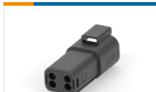
TE Part #1-2600030-0 4CCT BLACK RECEPT W/LARGE SEAL