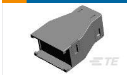
TE Part #1986185-1 Strain Relief,6 Posn,D5200 Dynamic. 2