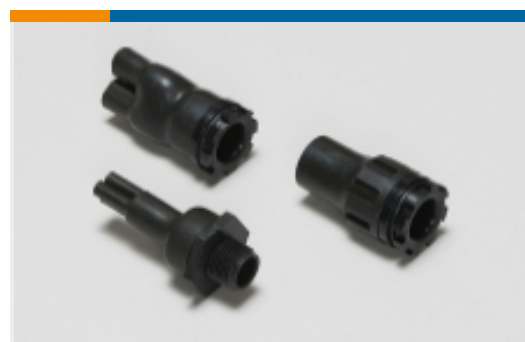
Cable Entry Seals(19)