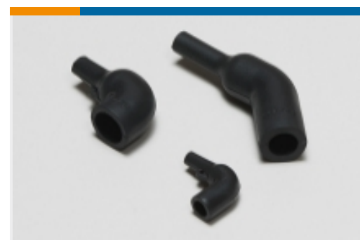
Heat Shrink Boots(1)