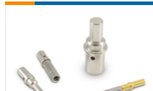
TE Part #0462-201-16141 DEUTSCH Solid Contacts