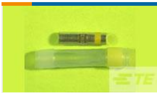
TE Part # 650075-000 D-436-37