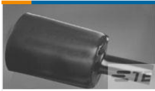
TE Part #CX7198-000 RHW-16/4-1200/ADH-0