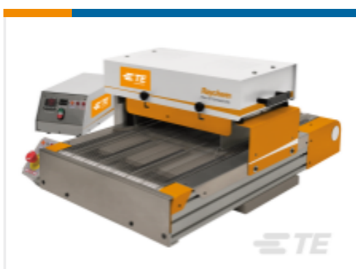
TE Part # 2394980-1 MOD 105 TUN OVEN, 69" ENTRY, STARDARD