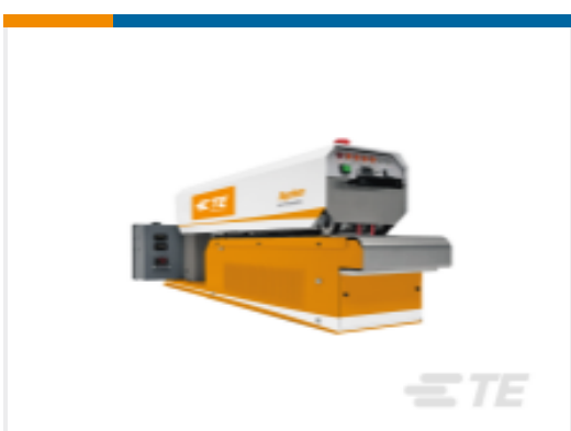
TE Part # 714529-000 CLTEQ-M19-BELT-HTR