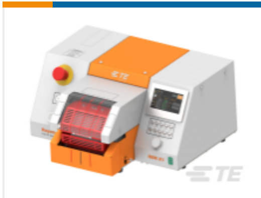
TE Part # 2234800-2 RBK-X1 CE STD