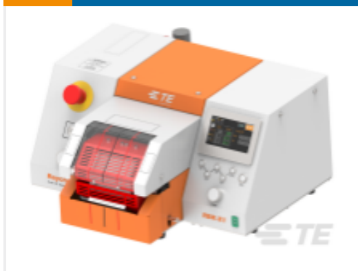
TE Part # 1-2234800-4 RBK-X1 CE, W/ AIR COOLING