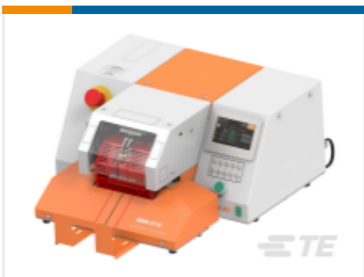
TE Part # 2376800-1 RBK-X1C STD