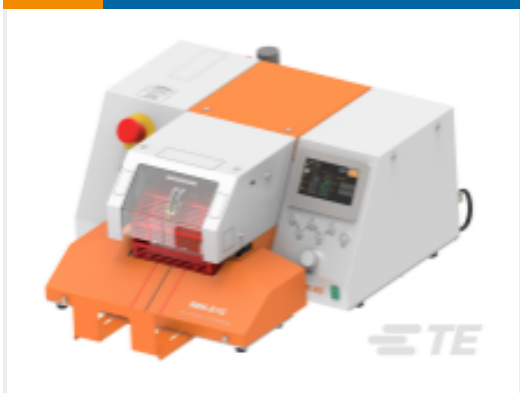
TE Part # 1-2376800-4 RBK-X1C CE, W/ AIR COOLING