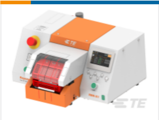
TE Part # 1-2234800-3 RBK-X1, W/ AIR COOLING