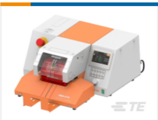
TE Part # 2376800-2 RBK-X1C CE STD