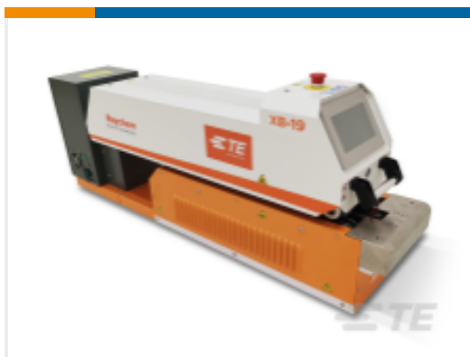
TE Part # 2375320-1 XB19 Belt Heater, STD