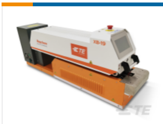
TE Part # 2375320-2 XB19 Belt Heater, 150mm (6") Version