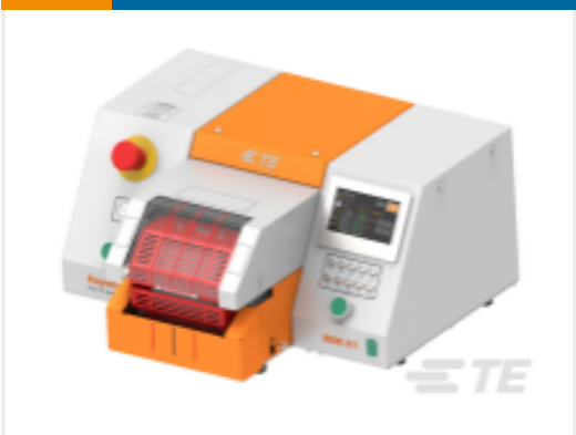
TE Part # 2234800-1 RBK-X1 STD