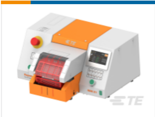
TE Part # 1-2234800-1 RBK-X1, AUTO TRIGGER