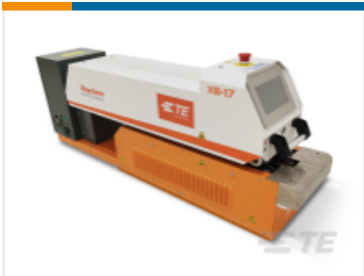
TE Part # 2375310-1 XB17 Belt Heater, 220V