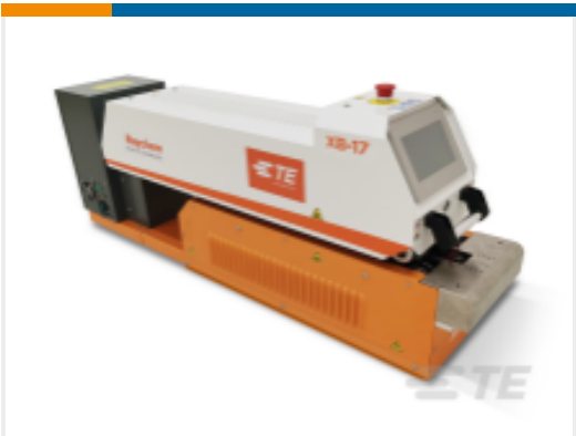
TE Part # 2375310-2 XB17 Belt Heater, 110V