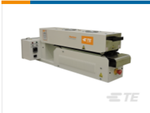
TE Part # 2280355-1 220 V MODEL 17