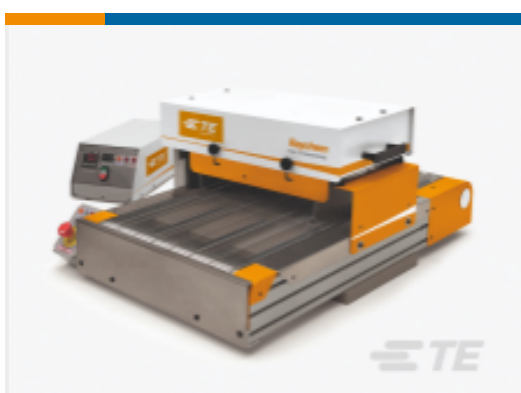
TE Part # 955018-000 CLTEQ-M105-TUNNEL-OVEN