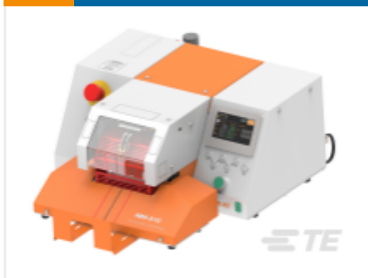
TE Part # 1-2376800-3 RBK-X1C, W/ AIR COOLING