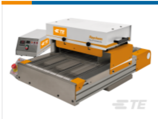
TE Part # 2326489-1 MODEL 105 TUNNEL OVEN, 36" ENTRY, STAND A