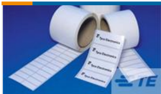
TE Part #8-1768018-1 EET-2570P-9