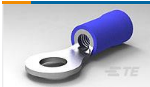
TE Part #34160 TERMINAL,PG R 16-14 8