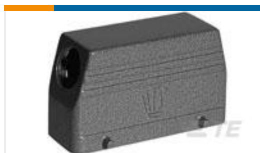
TE Part #2-1102319-6 HB-K.24.STS.1.29.G