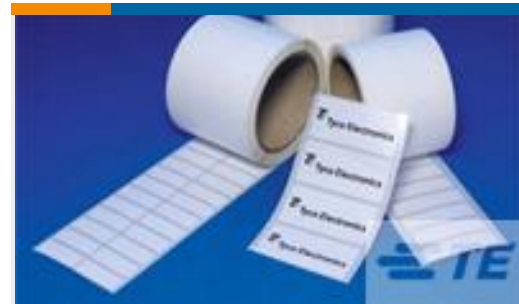
TE Part #1-1768018-7 EET-0920P-9