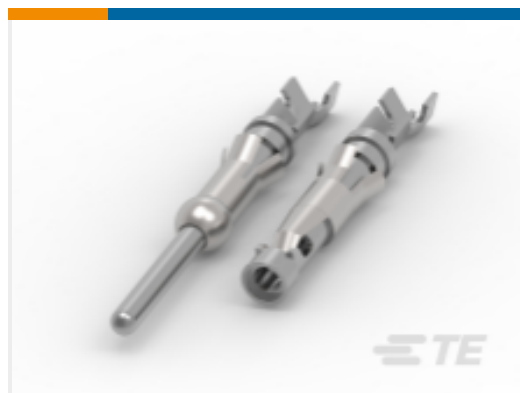
TE Part #66101-4 Pin and Socket Contacts, Type III, LP