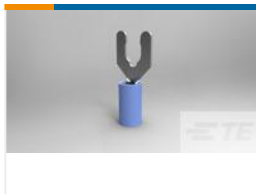
TE Part #52937-1 TERMINAL,PIDG SPR SPD 16-14 10