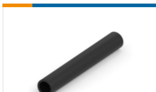
TE Part #CB5051-000 BSTS/BSTS-FR Heat Shrink Tubing