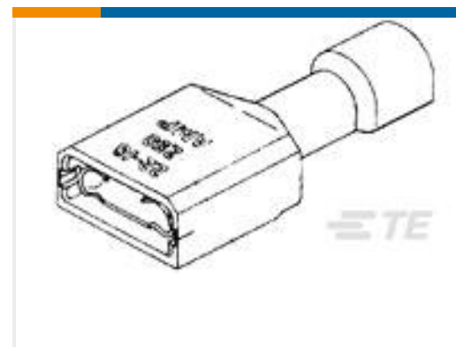
TE Part #3-350819-2 ULTRA-FAST 250 ASY REC 16-14 AWG TPBR