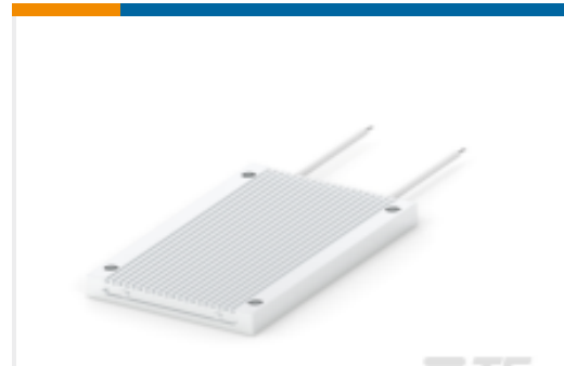
TE Part #2176248-7 TJT 250W 10R 5%