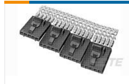
TE Part #103958-3 5X4 MTE RCPT SR LATCH .100CL