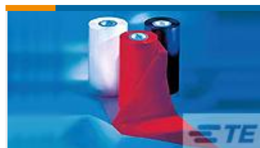
TE Part #310109-000 TMS-101-RIBBON-4RPSCE