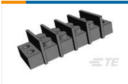
TE Part #1546306-4 4P .374" DR BARRIER STRIP